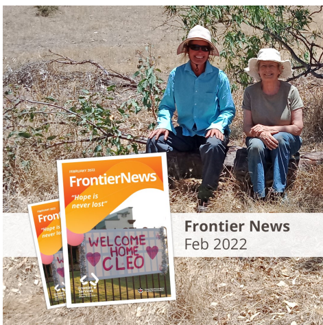
Frontier News Feb 2022