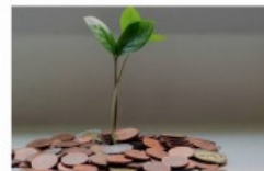
Every little bit helps